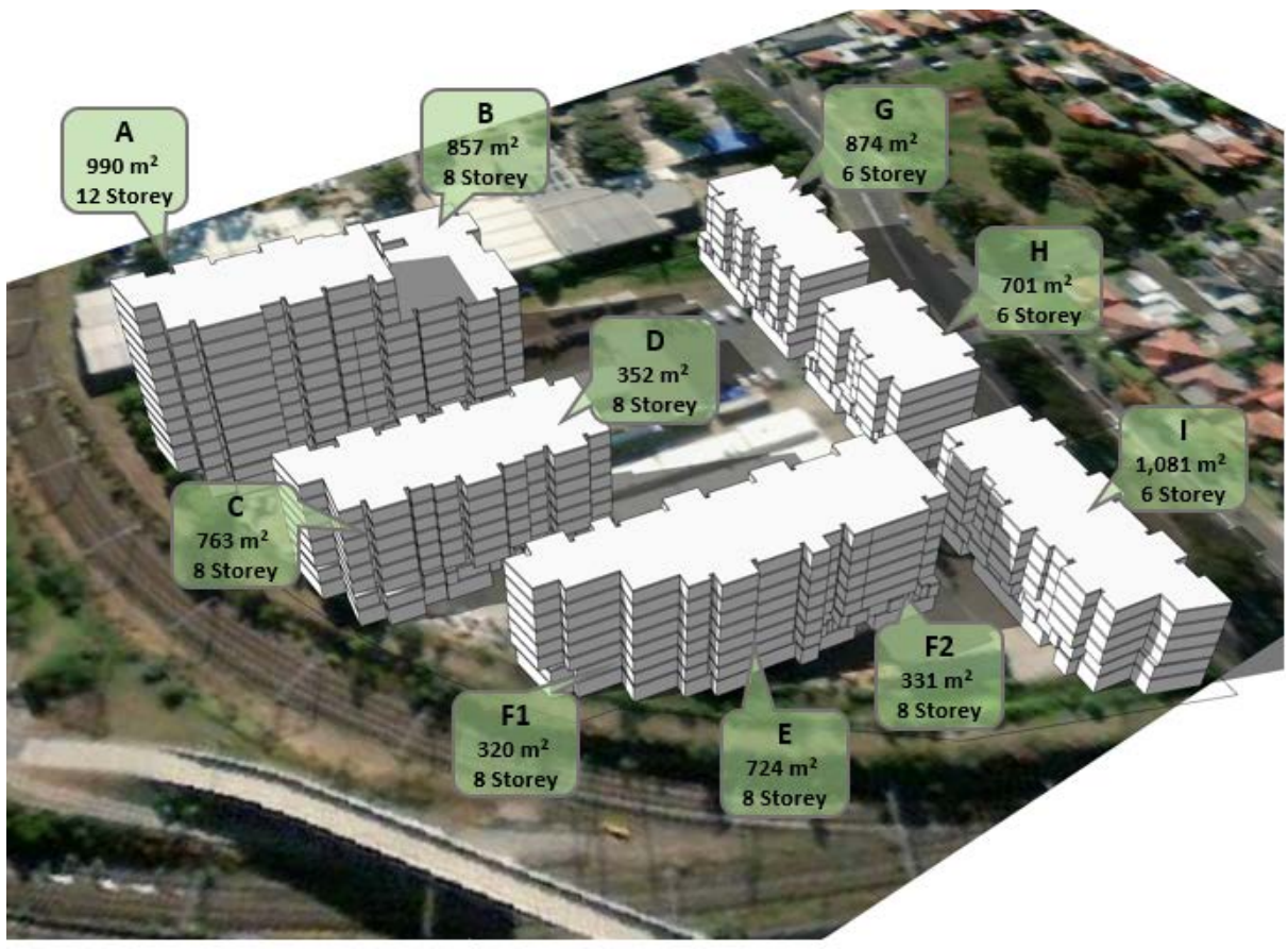
Figure 4 - Proponent's Proposed Scheme with building heights as recommended by McGregor Coxall