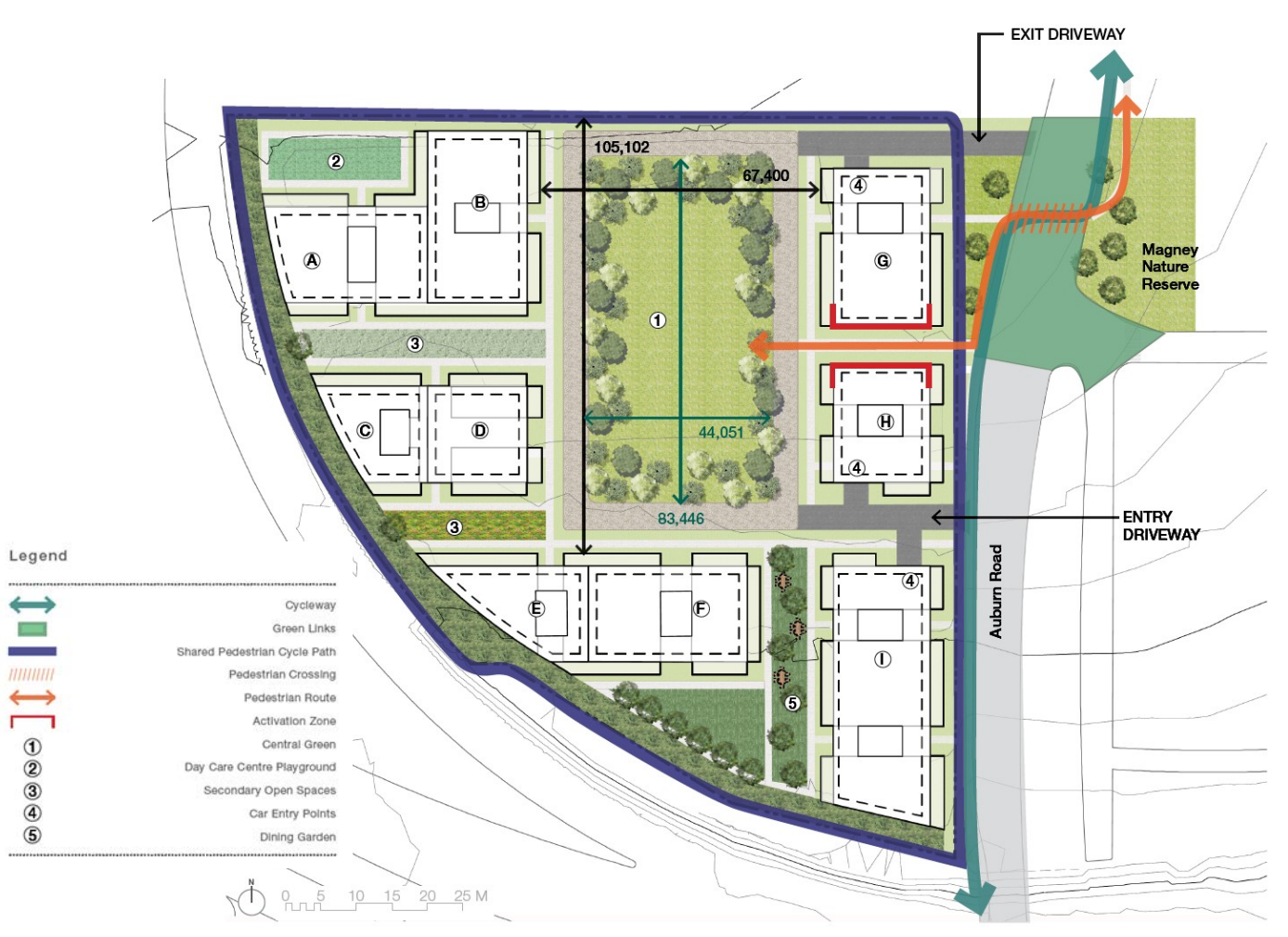
Figure 1 – McGregor Coxall's Scheme January 2019

The following outlines the work undertaken by the independent consultant McGregor Coxall, the proponent and the Department.