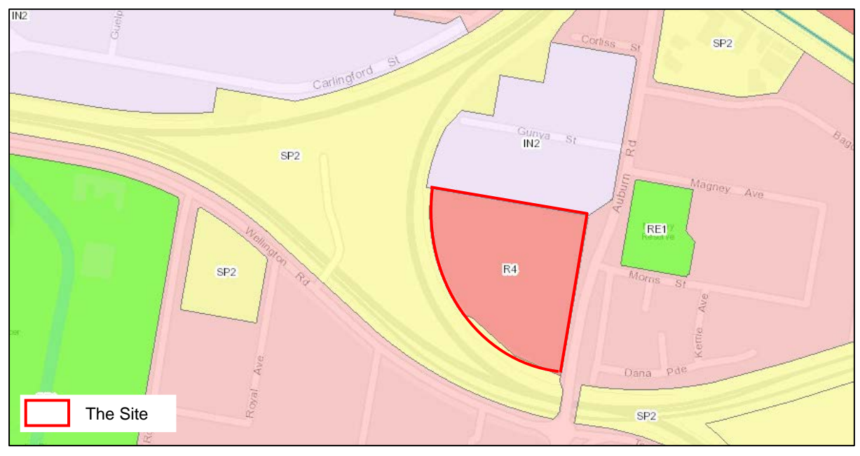
Figure 7 - Current land zoning

Figure 7 to Figure 9 below shows the existing planning controls applying to the site and its development.