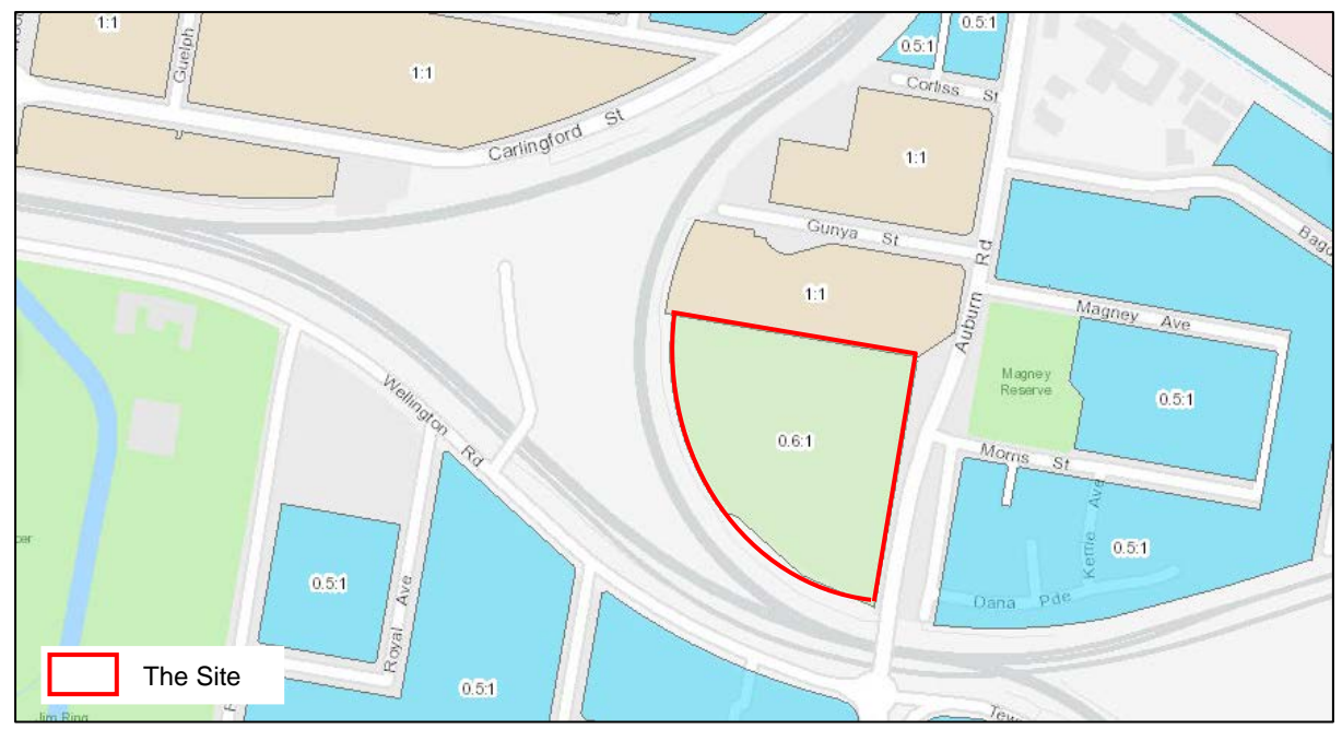
Figure 9 - Current floor space ratio control