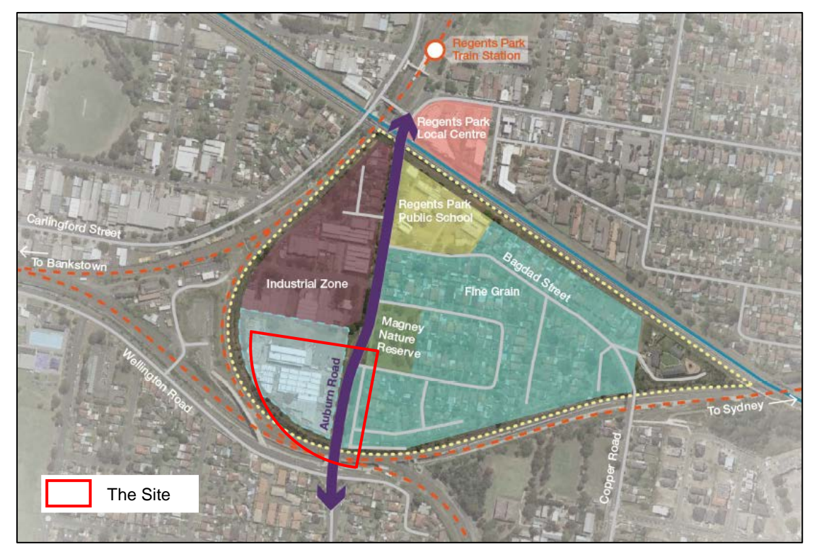
Figure 6 - Surrounding land uses (McGregor Coxall 2019)