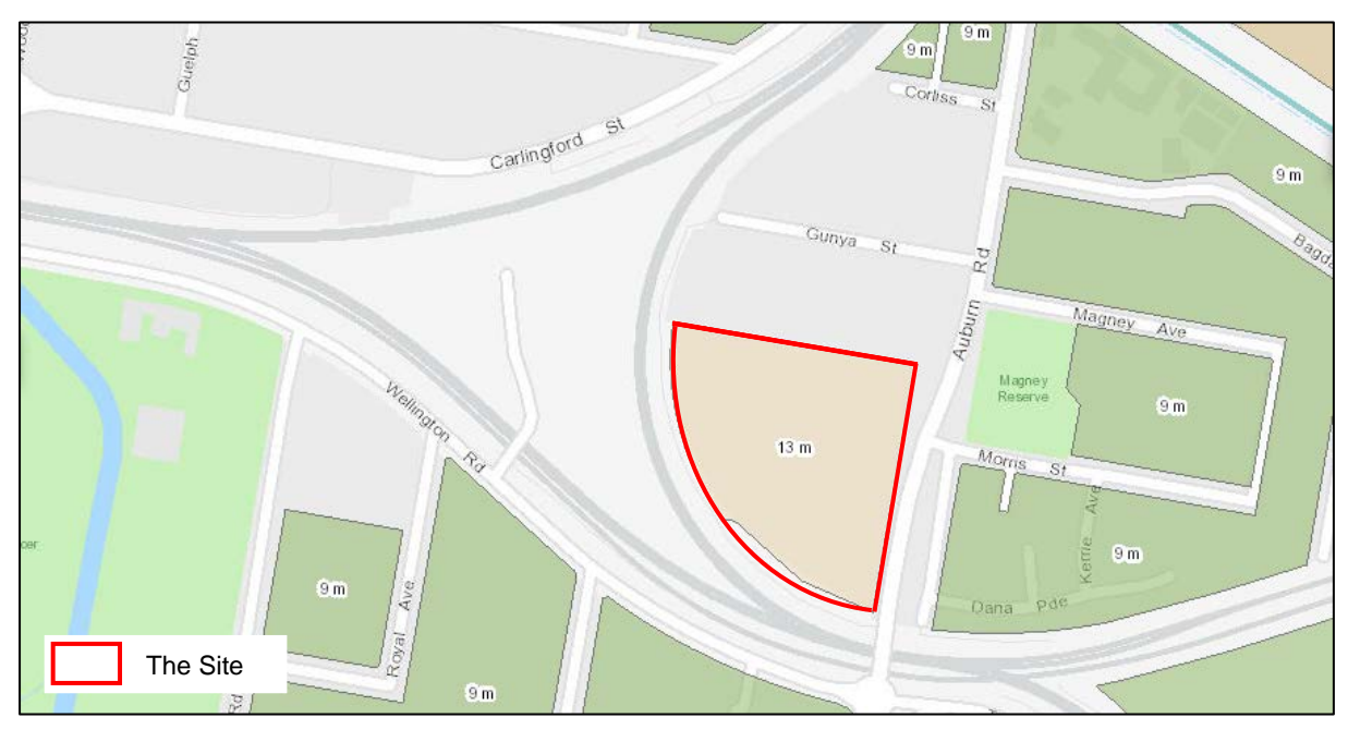
Figure 8 - Current height of building control