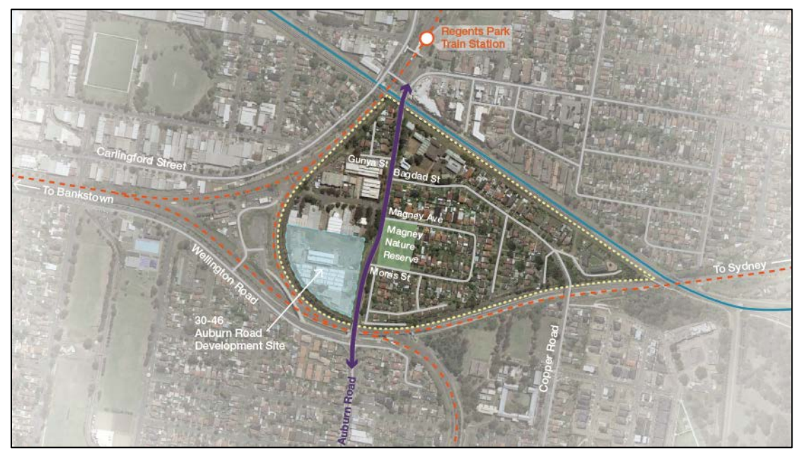
Figure 5 - Site location (McGregor Coxall 2019)

Regents Park is located about 3.5 kilometres north west of the Bankstown Central Business District (CBD). It is bounded to the east by Auburn Road, to the south and west by the freight rail line, and to the north by existing industrial land. Figure and Figure shows the site location.