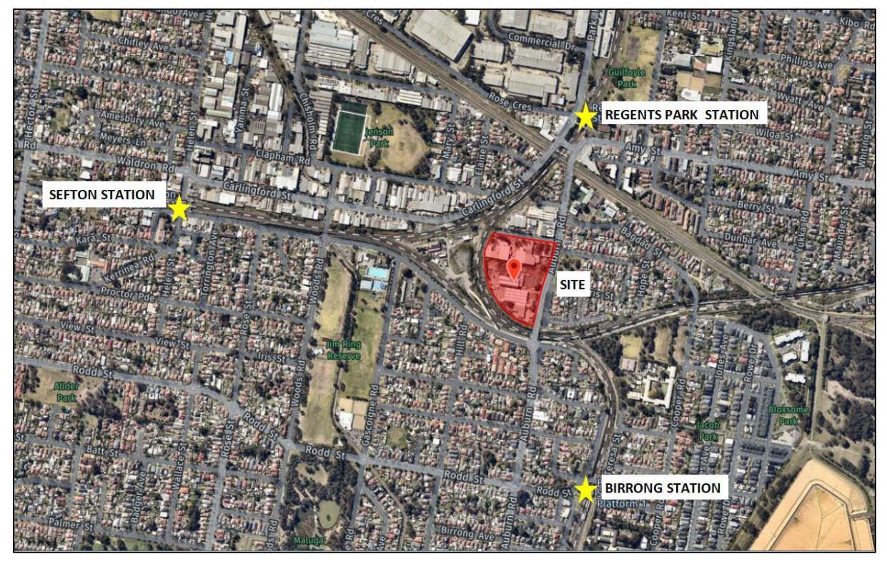
Figure 10 - Site location

Figure shows the immediate surrounding land uses.