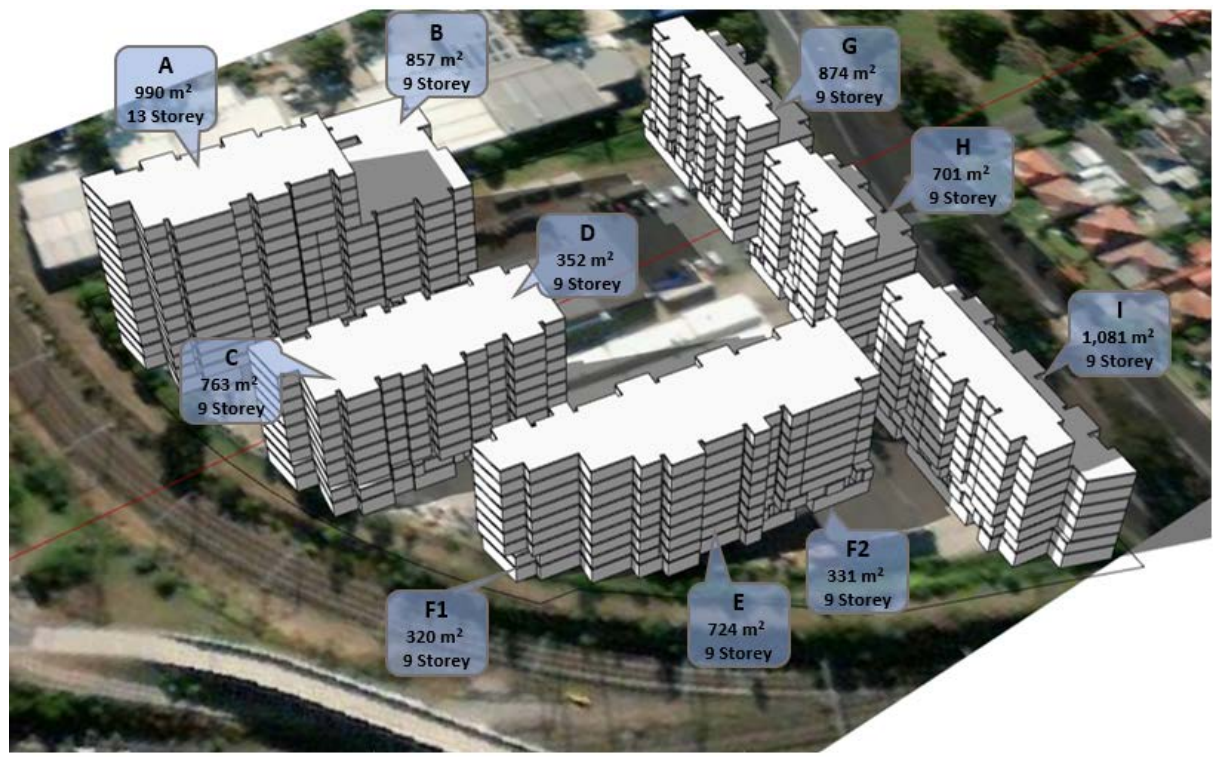
Figure 3 - Proponent's Proposed Scheme